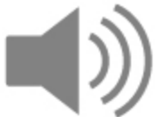
The 12th International Sound Poetry Festival, 2 of 4 (AM.1980.04.XX.B)