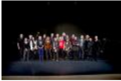
Composers and performers of the 23rd Other Minds Festival, standing on stage, San Francisco CA (2018) (IM.OM.FP.0023.001)