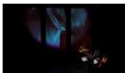
The Del Sol String Quartet performing Ken Ueno's "Peradam" with live video projections, vs. 4, OM 17 (IM.OM.FP.0017b.005)