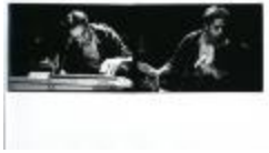
Simon Steen-Anderson performing during a rehearsal prior to OM 17, vs. 2, San Francisco CA (2012) (IM.OM.FP.0017.016)