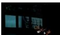
The Del Sol String Quartet performing Ken Ueno's "Peradam" with live video projections, OM 17 (IM.OM.FP.0017b.001)