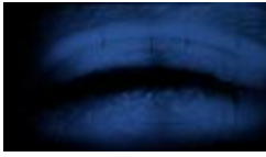
Projection image of an eye lid during performance of "Half a Bit of Nothing Integrated, for amplified objects, and live video" by Simon Steen-Anderson, OM 17 (IM.OM.FP.0017a.003)