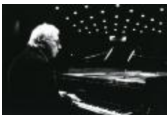
Harold Budd, seated and playing a piano during rehearsals prior to OM 17, San Francisco CA (2012) (IM.OM.FP.0017.007)