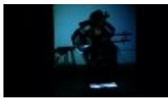
Tanja Orning performing Simon Steen-Andersen's "Study for String Instrument No. 3, for cello and video" at OM 17 (IM.OM.FP.0017c.001)