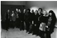
Directors and artists of the 17th Other Minds Festival lined up backstage, San Francisco CA (2012) (IM.OM.FP.0017.015)