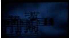
Projection image of musical notation during performance of "Half a Bit of Nothing Integrated, for amplified objects, and live video" by Simon Steen-Anderson, OM 17 (IM.OM.FP.0017a.001)