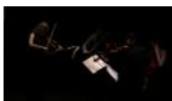
The Del Sol String Quartet performing Ken Ueno's "Peradam", OM 17 (IM.OM.FP.0017b.002)