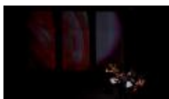
The Del Sol String Quartet performing Ken Ueno's "Peradam" with live video projections, vs. 3, OM 17 (IM.OM.FP.0017b.004)