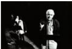
Three quarter length portrait of Robert Ashley onstage with performers during the 1st Other Minds Festival, San Francisco (1993) (IM.OM.FP.0001.044)