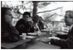
Several artists from the 1st Other Minds Festival seated at the outdoor dining table at the Djerassi Resident Artists Program, Woodside, CA (1993) (IM.OM.FP.0001.051)