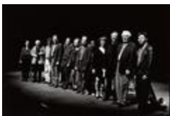
Full length view of the participating composers of the first Other Minds Festival standing on stage, San Francisco (1993) (IM.OM.FP.0001.043)