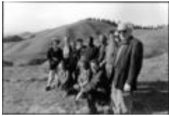
Other Minds Festival 1 participants and friends at the Djerassi Resident Artists Program in Woodside, CA (1993) (IM.OM.FP.0001.054)