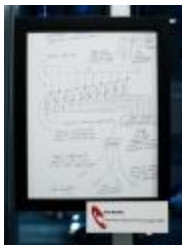
Don Buchla's score for "Harmonic Pendulum", exhibited during OM 19 (2014) (IM.OM.FP.0019a.015)