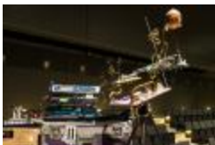
Side view of Mark Applebaum's "Mouseketier" instrument used in "Mouseketier Praxis", performed at OM 19, San Francisco CA (2014) (IM.OM.FP.0019a.002)