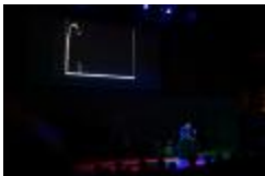
Charles Céleste Hutchins performing "Cloud Drawings" at OM 19 (2014) (IM.OM.FP.0019a.022)