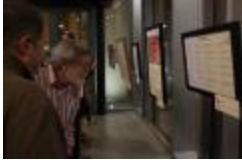
Don Buchla looking at Myra Melford's score in the auction exhibit during OM 19 (2014) (IM.OM.FP.0019a.025)