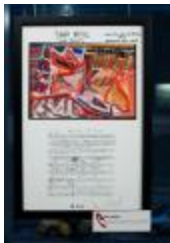
Myra Melford's score for "Piano Music", exhibited during OM 19 (2014) (IM.OM.FP.0019a.016)