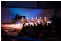
The pre-concert panel discussion for OM 19 on March 1, (2014) (IM.OM.FP.0019a.021)