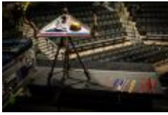
Mark Applebaum's "Mouseketier" instrument used in "Mouseketier Praxis" performed at OM 19, San Francisco CA (2014) (IM.OM.FP.0019a.001)