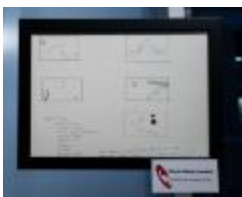
A untitled graphic score by Charles Céleste Hutchins exhibited during OM 19 (2014) (IM.OM.FP.0019a.019)