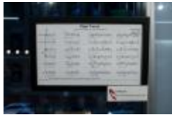
John Bischoff's score for "Edge Transit", exhibited during OM 19 (2014) (IM.OM.FP.0019a.017)