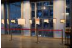
The OM 19 composers score exhibition at SFJAZZ, San Francisco CA (2014) (IM.OM.FP.0019a.010)