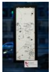
An untitled score by Mark Applebaum exhibited during OM 19 (2014) (IM.OM.FP.0019a.012)