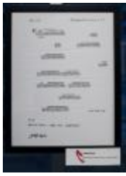
Joseph Byrd's score for "Water Music" exhibited during OM 19 (2014) (IM.OM.FP.0019a.011)