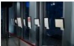
A view of the hanging score exhibition during OM 19 (2014) (IM.OM.FP.0019a.020)