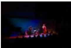
The Actual Trio performing during the last concert of OM 19 (2014) (IM.OM.FP.0019a.023)