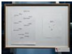
Score pages for "Tree Piece #17" by Wendy Reid, exhibited during OM 19 (2014) (IM.OM.FP.0019a.014)