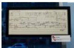
A score for "Publication is the Auction of the Mind of Man" by John Schott exhibited during OM 19 (2014) (IM.OM.FP.0019a.013)