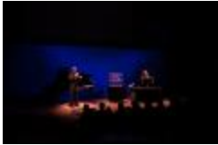
Wendy Reid's "Tree Piece #55: lulu variations" being performed during OM 19 (2014) (IM.OM.FP.0019a.024)