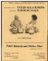
CCPA Presents: Ustad Alla Rakha and Zakir Hussain, with Mickey Hart (CCPA.POS.026)