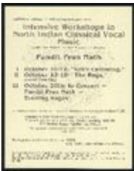
CCPA Presents: Intensive Workshops in North Indian Classical Vocal Music (1984, 2) (CCPA.POS.007)