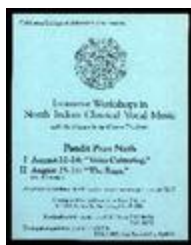
CCPA Presents: Intensive Workshops in North Indian Classical Vocal Music with Pandit Pran Nath (1983) (CCPA.POS.034)