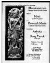
CCPA Presents: Bharatanatyam, Classical South Indian Dance (CCPA.POS.040)