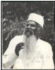
CCPA Presents: Pandit Pran Nath, Raga Cycle (CCPA.POS.008)