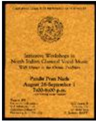
CCPA Presents: Intensive Workshops in North Indian Classical Vocal Music with Pandit Pran Nath (1984, 1) (CCPA.POS.032)