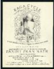
CCPA Presents: Raga Cycle, Pandit Pran Nath Sunday Concert Series (CCPA.POS.012)