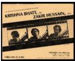
CCPA and Sami Mahal Present: Krishna Bhatt and Zakir Hussain (CCPA.POS.028)