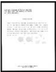
CCPA Reminder Notice: Pandit Pran Nath's House Concert Series Continues (CCPA.POS.011)