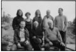
Group portrait of the featured OM 15 composers, Woodside CA., vs 2 (2010) (IM.OM.FP.0015.014b)