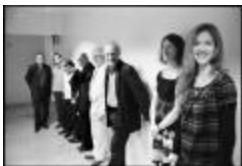
Group portrait of the featured OM 15 composers, standing, facing camera, San Francisco, CA. (2010) (IM.OM.FP.0015.038)