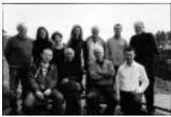
Featured OM 15 composers with festival organizers, standing and sitting, facing forward, Woodside CA., (2010) (IM.OM.FP.0015.026)