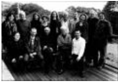
Group portrait of the featured OM 15 composers, performers, and organizers, Woodside CA., (2010) (IM.OM.FP.0015.015)