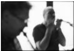
Two unidentified musicians, head a shoulders portrait, artistically out of focus, rehearsing, vs 2 (2010) (IM.OM.FP.0015.019b)