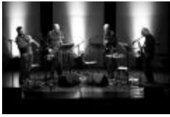
The ROVA Saxophone Quartet, performing on stage at OM 15, San Francisco CA., (2010) (IM.OM.FP.0015b.021)