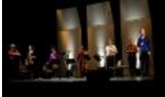
The Left Coast Chamber Ensemble, full length portrait, standing on stage, facing forward, San Francisco CA., (2010) (IM.OM.FP.0015b.003)