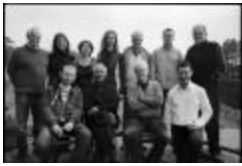
Group portrait of the featured OM 15 composers and organizers, Woodside CA. (2010) (IM.OM.FP.0015.032)