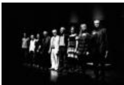
The featured OM 15 composers, standing, facing forward, on stage, San Francisco CA., (2010) (IM.OM.FP.0015.025)