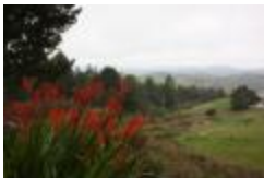
California landscape with red tinged plants, Woodside CA., (2010) (IM.OM.FP.0015d.005)