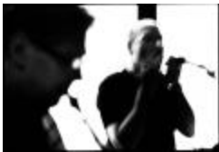
Two unidentified musicians, head a shoulders portrait, artistically out of focus, rehearsing, (2010) (IM.OM.FP.0015.019)