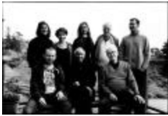
Group portrait of the featured OM 15 composers, Woodside CA., (2010) (IM.OM.FP.0015.014)