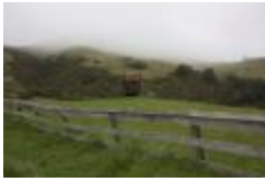
Green meadow with fence, cart, and fog shrouded hills, Woodside CA., (2010) (IM.OM.FP.0015d.004)