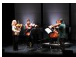
The Del Sol String Quartet, full length portrait, rehearsing for OM 14 (IM.OM.FP.0014b.007)