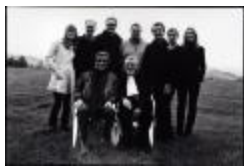
Featured OM 14 composers at Woodside CA, (2009) (IM.OM.FP.0014.012)