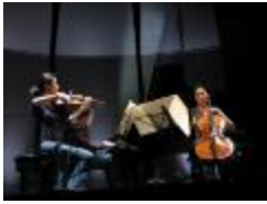
The piano trio ensemble, Trio con Brio Copenhagen, rehearsing for OM 14, ver. 1, San Francisco CA, (2009) (IM.OM.FP.0014b.004)