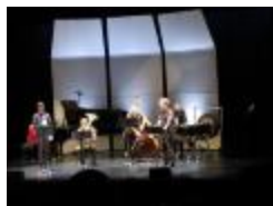
A musical sextet, full length portrait, performing on stage, San Francisco CA., (2009) (IM.OM.FP.0014b.014)