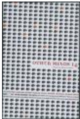
Poster for Other Minds Festival 14, 2009 (OMF.2009.03.05-07.PO)