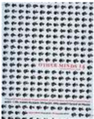
Other Minds Festival 14: Concert Program Guide (OMF.2009.03.05-03.07.PP)