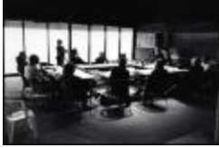
Linda Catlin Smith, seated before a microphone, giving a presentation to a room full of OM 14 composers and organizers, Woodside CA., (2009) (IM.OM.FP.0014.028)