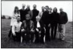
Featured OM 14 composers and organizers at Woodside CA, (2009) (IM.OM.FP.0014.025)