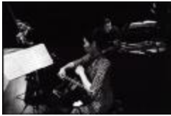
The piano trio ensemble, Trio con Brio Copenhagen, rehearsing on stage during OM 14, San Francisco CA, (2009) (IM.OM.FP.0014.003)