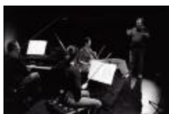
Members of the chamber ensemble, Trio con Brio Copenhagen, listen to composer Bent Sørensen, during a rehearsal for OM 14, San Francisco CA, (2009) (IM.OM.FP.0014.005)