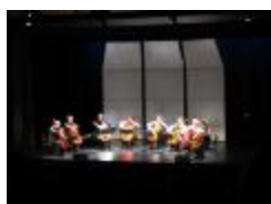
The Amsterdam Cello Octet, performing on stage, San Francisco CA., (2009) (IM.OM.FP.0014b.009)