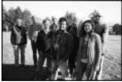
Group portrait of OM 16 composers standing outdoors, Woodside CA (2011) (IM.OM.FP.0016.005)