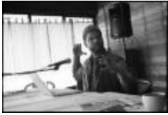
Head and shoulders portrait of Jason Moran during his presentation at the Djerassi Resident Artists Program prior to OM 16, Woodside CA (2011) (IM.OM.FP.0016.006)