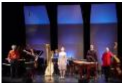
Performers of Louis Andriessen's "Letter to Cathy" during the third concert of OM 16, San Francisco (2011) (IM.OM.FP.0016b.012)