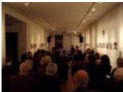
The Other Minds 16 Composer Fellowship Concert at the Meridian Gallery, San Francisco CA (2011) (IM.OM.FP.0016b.004)