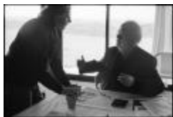
Half length portrait of Janice Giteck and Louis Andriessen, seated, in discussion, Woodside CA (2011) (IM.OM.FP.0016.011)