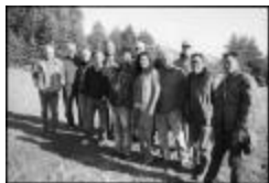
A group portrait of the artists and organizers of the 16th Other Minds Festival, Woodside CA (2011) (IM.OM.FP.0016.012)