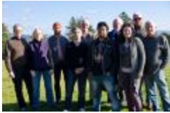
OM 16 Composers and organizers outdoors at the Djerassi Resident Artists Program, Woodside CA (2011) (IM.OM.FP.0016a.011)