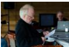
Louis Andriessen during discussions at the Djerassi Resident Artists Program, Woodside CA (2011) (IM.OM.FP.0016a.001)