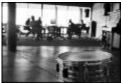
Han Bennink's snare drum, Woodside CA (2011) (IM.OM.FP.0016.002)