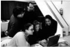
Several OM 4 artists gathered around a laptop during the Djerassi Resident Artists Program in Woodside, CA (1997) (IM.OM.FP.0004.027)