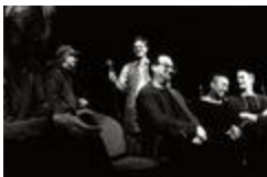
Several participants of the 4th Other Minds Festival seated on stage during a panel discussion, San Francisco, CA (1997) (IM.OM.FP.0004.017)