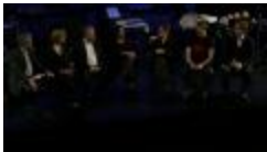
Panel discussion participants seated onstage prior to the third concert of OM 18, San Francisco CA (2013) (IM.OM.FP.0018a.051)