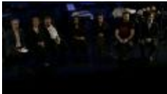
Panel discussion participants seated onstage prior to the third concert of OM 18, vs.2, San Francisco CA (2013) (IM.OM.FP.0018a.052)