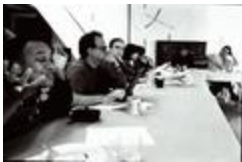
Several OM 4 artists, seated and listening, during one of the private composer presentations at the Djerassi Resident Artists Program, Woodside, CA (1997) [v2] (IM.OM.FP.0004.021)