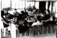
OM 4 participants in discussion, seated on couches at the Djerassi Resident Artists Program, Woodside, CA (1997) (IM.OM.FP.0004.023)