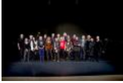
Composers and performers of the 23rd Other Minds Festival, standing on stage, San Francisco CA (2018) (IM.OM.FP.0023.001)