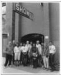
Participants of the 1991 Composer-to-Composer Festival, standing outside the Sheridan Opera House, Telluride, CO. (IM.CA.CC.1991.002)