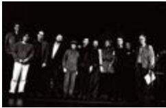
Participants of Other Minds 4, full length portrait, standing, facing forward, San Francisco CA, (1997) (IM.OM.FP.0004.009)