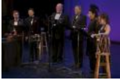
The Other Minds Ensemble performing works by Ernst Toch during OM 23, San Francisco CA (April 11, 2018) (IM.OM.FP.0023.019)