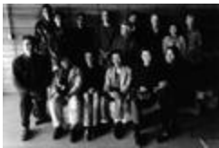
Featured participants of OM 4, full length portrait, standing and seated, facing forward, Woodside CA, (1997) (IM.OM.FP.0004.008)