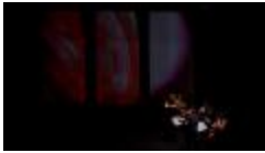
The Del Sol String Quartet performing Ken Ueno's "Peradam" with live video projections, vs. 3, OM 17 (IM.OM.FP.0017b.004)