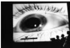
asamisimasa performing Simon Steen-Anderson's "Half a Bit of Nothing Integrated, for amplified objects, and live video" during OM 17, San Francisco CA (2012) (IM.OM.FP.0017.003)