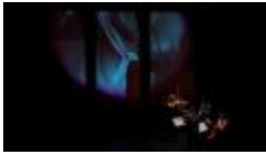
The Del Sol String Quartet performing Ken Ueno's "Peradam" with live video projections, vs. 4, OM 17 (IM.OM.FP.0017b.005)