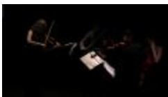
The Del Sol String Quartet performing Ken Ueno's "Peradam", OM 17 (IM.OM.FP.0017b.002)