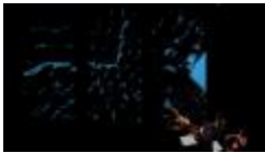
The Del Sol String Quartet performing Ken Ueno's "Peradam" with live video projections, vs. 2, OM 17 (IM.OM.FP.0017b.003)