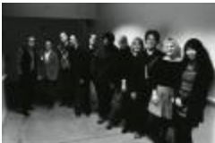
Directors and artists of the 17th Other Minds Festival lined up backstage, San Francisco CA (2012) (IM.OM.FP.0017.015)