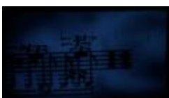
Projection image of musical notation during performance of "Half a Bit of Nothing Integrated, for amplified objects, and live video" by Simon Steen-Anderson, OM 17 (IM.OM.FP.0017a.001)