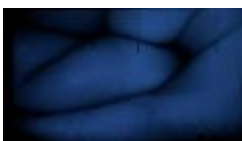
Projection image of skin during performance of "Half a Bit of Nothing Integrated, for amplified objects, and live video" by Simon Steen-Anderson, OM 17 (IM.OM.FP.0017a.002)