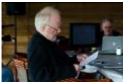
Louis Andriessen during discussions at the Djerassi Resident Artists Program, Woodside CA (2011) (IM.OM.FP.0016a.001)