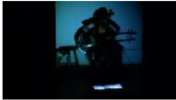
Tanja Orning performing Simon Steen-Andersen's "Study for String Instrument No. 3, for cello and video" at OM 17 (IM.OM.FP.0017c.001)