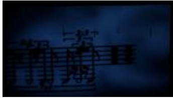
Projection image of musical notation during performance of "Half a Bit of Nothing Integrated, for amplified objects, and live video" by Simon Steen-Anderson, OM 17 (IM.OM.FP.0017a.001)