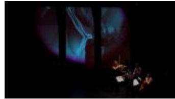
The Del Sol String Quartet performing Ken Ueno's "Peradam" with live video projections, vs. 4, OM 17 (IM.OM.FP.0017b.005)