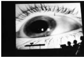
asamisimasa performing Simon Steen-Anderson's "Half a Bit of Nothing Integrated, for amplified objects, and live video" during OM 17, San Francisco CA (2012) (IM.OM.FP.0017.003)