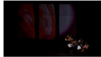
The Del Sol String Quartet performing Ken Ueno's "Peradam" with live video projections, vs. 3, OM 17 (IM.OM.FP.0017b.004)