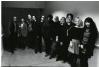
Directors and artists of the 17th Other Minds Festival lined up backstage, San Francisco CA (2012) (IM.OM.FP.0017.015)