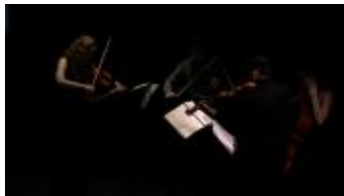
The Del Sol String Quartet performing Ken Ueno's "Peradam", OM 17 (IM.OM.FP.0017b.002)