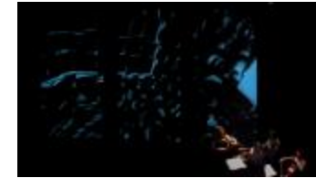
The Del Sol String Quartet performing Ken Ueno's "Peradam" with live video projections, vs. 2, OM 17 (IM.OM.FP.0017b.003)