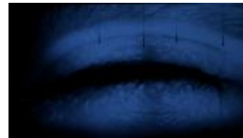
Projection image of an eye lid during performance of "Half a Bit of Nothing Integrated, for amplified objects, and live video" by Simon Steen-Anderson, OM 17 (IM.OM.FP.0017a.003)