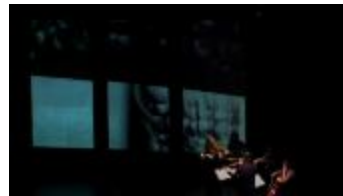
The Del Sol String Quartet performing Ken Ueno's "Peradam" with live video projections, OM 17 (IM.OM.FP.0017b.001)