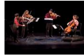
Del Sol Quartet performing on stage during OM 11, ver. 10, San Francisco CA (2005) (IM.OM.FP.0011b.019)