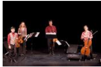
Del Sol Quartet performing on stage during OM 11, ver. 15, San Francisco CA (2005) (IM.OM.FP.0011b.024)