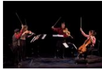
Del Sol Quartet performing on stage during OM 11, ver. 13, San Francisco CA (2005) (IM.OM.FP.0011b.022)