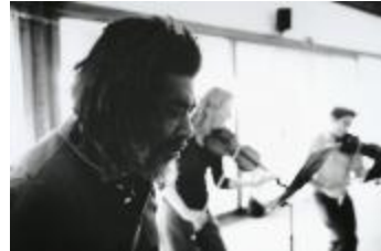
Ishmael Wadada Leo Smith, head and shoulders portrait, with members of the Del Sol Quartet in background, Woodside, CA, 2008 (IM.OM.FP.0013.001)