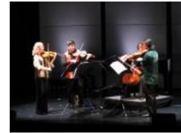
The Del Sol String Quartet, full length portrait, rehearsing for OM 14 (IM.OM.FP.0014b.007)