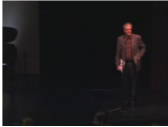
Other Minds Festival: OM 14: Concert 3 (OMF.2009.03.07.c2.02)