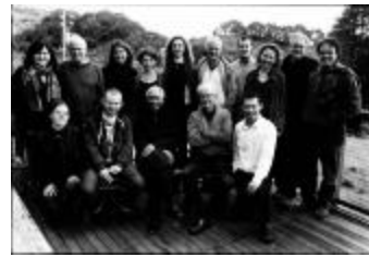
Group portrait of the featured OM 15 composers, performers, and organizers, Woodside CA., (2010) (IM.OM.FP.0015.015)