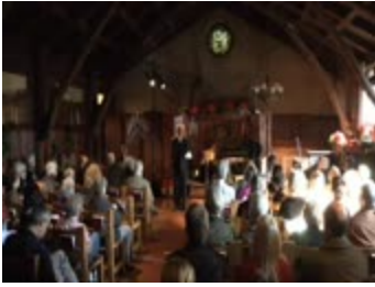
New Music Seance: 2008: Concert No. 1, Birds in Warped Time (video) (NMS.2008.12.06.1.c2)