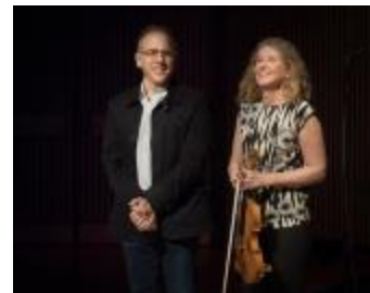
Composer Michael Gordon with violinist Kate Stenberg after a performance at OM 21, San Francisco CA (2016) (IM.OM.FP.0021.017)