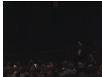
Other Minds Festival: OM 14: Concert 1 (OMF.2009.03.05.c2.02)