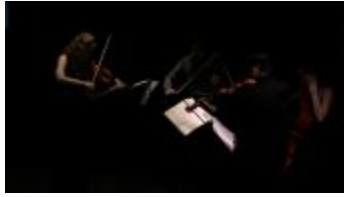
The Del Sol String Quartet performing Ken Ueno's "Peradam", OM 17 (IM.OM.FP.0017b.002)