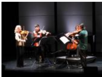
The Del Sol String Quartet, full length portrait, rehearsing for OM 14 (IM.OM.FP.0014b.007)