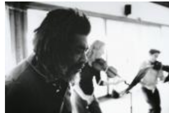
Ishmael Wadada Leo Smith, head and shoulders portrait, with members of the Del Sol Quartet in background, Woodside, CA, 2008 (IM.OM.FP.0013.001)