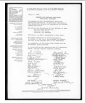
The manifesto on censorship, as written and signed by the participating composers of the 1990 Composer-to-Composer Festival, Telluride, CO.