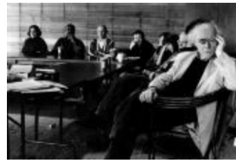
Featured OM 10 composers, half length portrait, seated at table, listening, Woodside CA., (2004) (IM.OM.FP.0010.020)