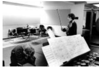
Tigran Mansurian, seated, head in hands, facing down and slightly right, and Kim Kashkashian with viola, half length portrait, facing left, (2004) (IM.OM.FP.0010.025)