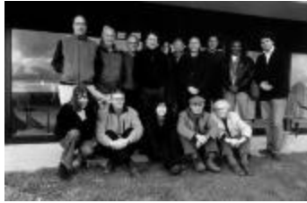
Featured OM 10 participants, full length portrait, standing and seated, facing forward, Woodside CA., (2004) (IM.OM.FP.0010.018)