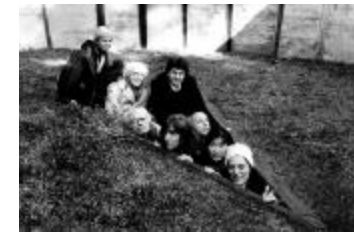
OM 10 participants, heads and shoulders & half length portrait, seated in ground sculpture, facing forward, Woodside CA., (2004) (IM.OM.FP.0010.019)