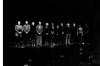
Featured OM 10 participants, full length portrait, standing, facing forward, San Francisco CA., (2004) (IM.OM.FP.0010.017)