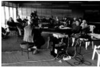
Joan Jeanrenaud, seated, back to camera, demonstrates cello to OM 10 participants, who are seated at conference table, facing forward, Woodside Ca., (2004) (IM.OM.FP.0010.014)