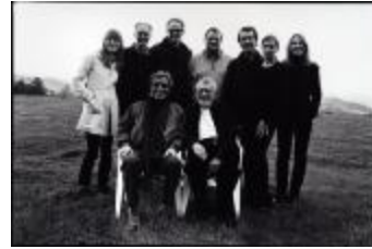
Featured OM 14 composers at Woodside CA, (2009) (IM.OM.FP.0014.012)