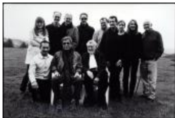
Featured OM 14 composers and organizers at Woodside CA, (2009) (IM.OM.FP.0014.025)