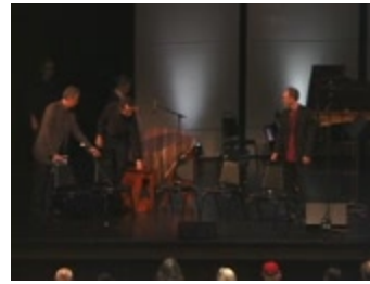
Other Minds Festival: OM 14: Panel Discussion 3 (OMF.2009.03.07.c2.01)