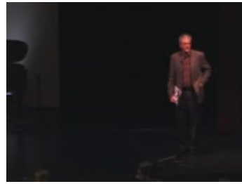
Other Minds Festival: OM 14: Concert 3 (OMF.2009.03.07.c2.02)