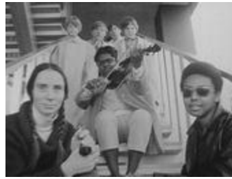
Oakland Symphony Youth Chamber Orchestra playing around the Bay Area (V.1968.XX.XX.c2)