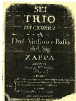
Speaking of Music with Frank Zappa (Program guide) (SOM.1984.05.20.PP)