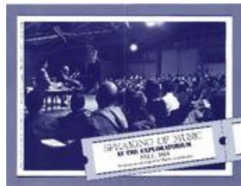
Speaking of Music, Fall 1984 (Program guide) (SOM.1984.XX.XX.PP.2)