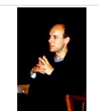
Side view of Brian Eno seated onstage during Speaking of Music at the Exploratorium, 1988 (IM.CA.PC.0067.003)