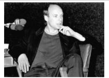
Brian Eno, seated onstage with leg over chair arm during Speaking of Music at the Exploratorium, 1988 (IM.CA.PC.0066.003)