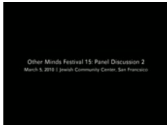
Other Minds Festival: OM 15: Panel Discussion 2 (OMF.2010.03.05.c2.01)