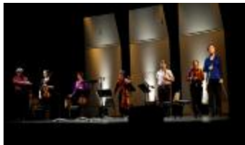
The Left Coast Chamber Ensemble, full length portrait, standing on stage, facing forward, San Francisco CA., (2010) (IM.OM.FP.0015b.003)