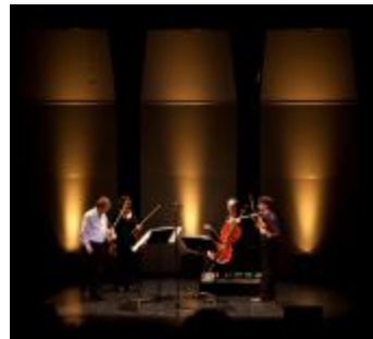
Quatuor Bozzini, full length portrait, performing at OM 15, San Francisco CA., (2010) (IM.OM.FP.0015b.002)