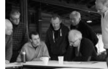
Some OM 15 composers and festival organizers examine a score, Woodside CA., (2010) (IM.OM.FP.0015d.013)