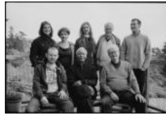
Group portrait of the featured OM 15 composers, Woodside CA., vs 2 (2010) (IM.OM.FP.0015.014b)