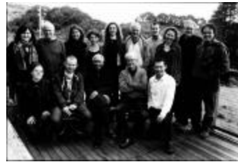
Group portrait of the featured OM 15 composers, performers, and organizers, Woodside CA., (2010) (IM.OM.FP.0015.015)