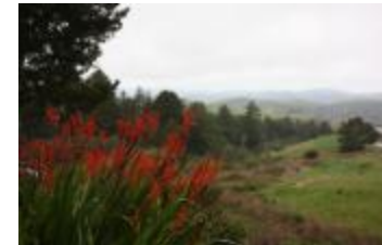
California landscape with red tinged plants, Woodside CA., (2010) (IM.OM.FP.0015d.005)