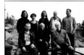
Group portrait of the featured OM 15 composers, Woodside CA., (2010) (IM.OM.FP.0015.014)