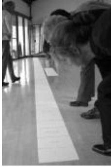
OM 15 composers, bending over, graphic score lined up on the floor, Woodside CA., (2010) (IM.OM.FP.0015d.016)