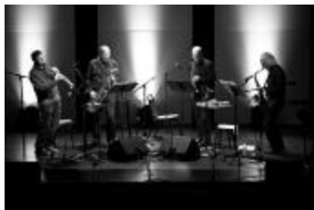
The ROVA Saxophone Quartet, performing on stage at OM 15, San Francisco CA., (2010) (IM.OM.FP.0015b.021)