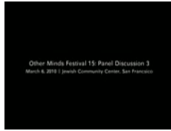
Other Minds Festival: OM 15: Panel Discussion 3 (OMF.2010.03.06.c2.01)