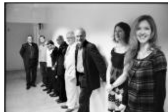
Group portrait of the featured OM 15 composers, standing, facing camera, San Francisco, CA. (2010) (IM.OM.FP.0015.038)