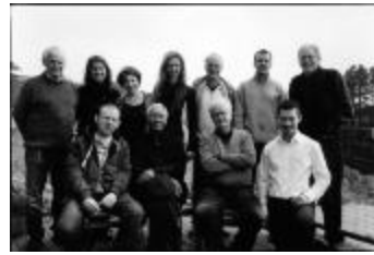
Featured OM 15 composers with festival organizers, standing and sitting, facing forward, Woodside CA., (2010) (IM.OM.FP.0015.026)