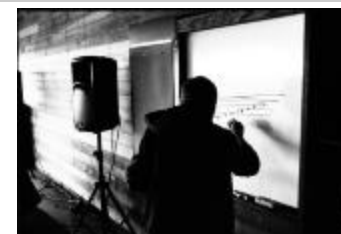
Pawe? Mykietyń, head and shoulders portrait, back to camera, writing on whiteboard, Woodside CA., (2010) (IM.OM.FP.0015.005)