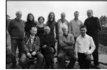
Group portrait of the featured OM 15 composers and organizers, Woodside CA. (2010) (IM.OM.FP.0015.032)