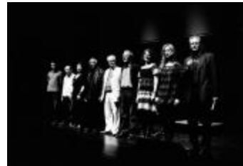
The featured OM 15 composers, standing, facing forward, on stage, San Francisco CA., (2010) (IM.OM.FP.0015.025)