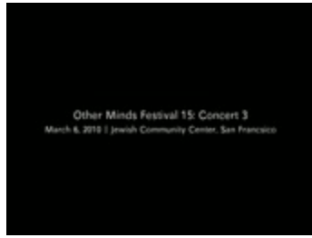
Other Minds Festival: OM 15: Concert 3 (OMF.2010.03.06.c2.02)