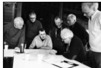
OM 15 composers and organizers gathered around a table while Tom Johnson points over a score, Woodside CA., (2010) (IM.OM.FP.0015.0030)