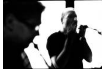
Two unidentified musicians, head a shoulders portrait, artistically out of focus, rehearsing, (2010) (IM.OM.FP.0015.019)