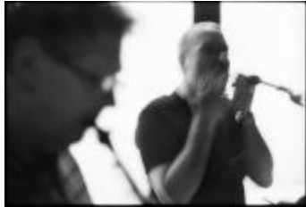
Two unidentified musicians, head a shoulders portrait, artistically out of focus, rehearsing, vs 2 (2010) (IM.OM.FP.0015.019b)