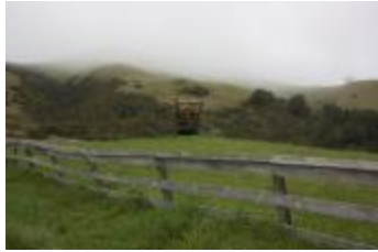
Green meadow with fence, cart, and fog shrouded hills, Woodside CA., (2010) (IM.OM.FP.0015d.004)