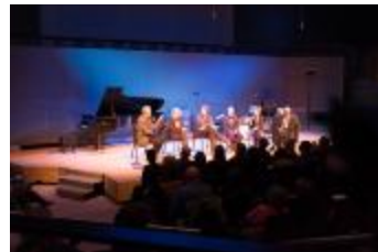
The pre-concert panel discussion for OM 19 on March 1, (2014) (IM.OM.FP.0019a.021)