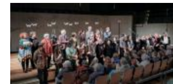
Other Minds Festival Alumni in attendance of OM 20, San Francisco CA (2015) (IM.OM.FP.0020a.001)