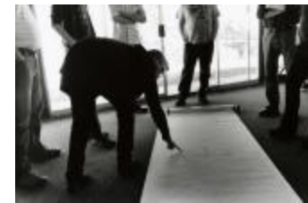
Wendy Reid pointing to an element on one of her scores while fellow composers look on, vs. 2, Woodside CA (2014) (IM.OM.FP.0019.007)