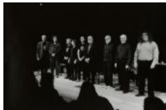
Charles Amirkhanian and OM 19 composers line up on stage, San Francisco CA (2014) (IM.OM.FP.0019.012)