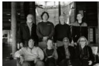
The participating composers of the 19th Other Minds Festival, Woodside CA (2014) (IM.OM.FP.0019.010)