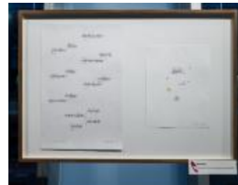
Score pages for "Tree Piece #17" by Wendy Reid, exhibited during OM 19 (2014) (IM.OM.FP.0019a.014)