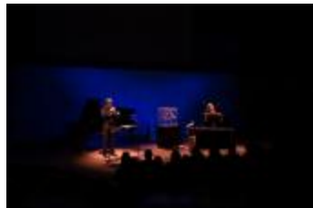
Wendy Reid's "Tree Piece #55: lulu variations" being performed during OM 19 (2014) (IM.OM.FP.0019a.024)