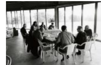
Portrait of OM 19 composers having lunch at the Djerassi Resident Artists Program, Woodside CA (2014) (IM.OM.FP.0019.016)