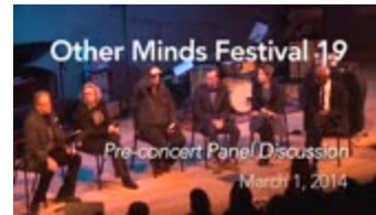
Other Minds Festival: OM 19: Panel Discussion and Concert 2 (Mar. 1, 2014), 1 of 6 (OMF.2014.03.01.c2.A)