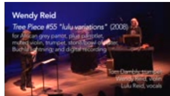
Other Minds Festival: OM 19: Panel Discussion and Concert 2 (Mar. 1, 2014), 4 of 6 (OMF.2014.03.01.c2.D)