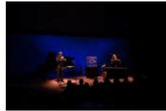
Wendy Reid's "Tree Piece #55: lulu variations" being performed during OM 19 (2014) (IM.OM.FP.0019a.024)