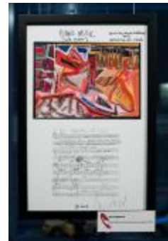
Myra Melford's score for "Piano Music", exhibited during OM 19 (2014) (IM.OM.FP.0019a.016)