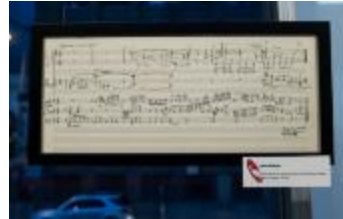
A score for "Publication is the Auction of the Mind of Man" by John Schott exhibited during OM 19 (2014) (IM.OM.FP.0019a.013)