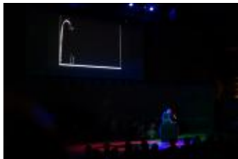
Charles Céleste Hutchins performing "Cloud Drawings" at OM 19 (2014) (IM.OM.FP.0019a.022)