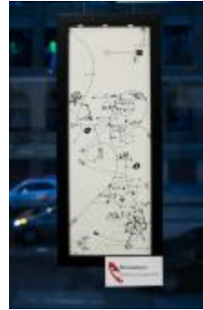
An untitled score by Mark Applebaum exhibited during OM 19 (2014) (IM.OM.FP.0019a.012)