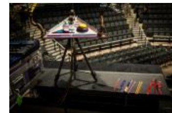
Mark Applebaum's "Mouseketier" instrument used in "Mouseketier Praxis" performed at OM 19, San Francisco CA (2014) (IM.OM.FP.0019a.001)