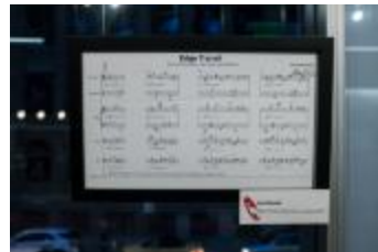
John Bischoff's score for "Edge Transit", exhibited during OM 19 (2014) (IM.OM.FP.0019a.017)