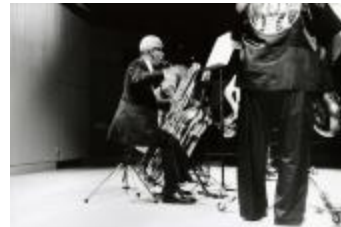
Roscoe Mitchell, seated, playing bass saxophone during a rehearsal for OM 19 (2014) (IM.OM.FP.0019.001)