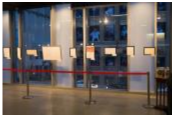
The OM 19 composers score exhibition at SFJAZZ, San Francisco CA (2014) (IM.OM.FP.0019a.010)