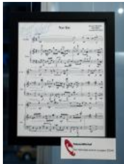
A score for Roscoe Mitchell's "Not Yet", exhibited during OM 19 (2014) (IM.OM.FP.0019a.018)