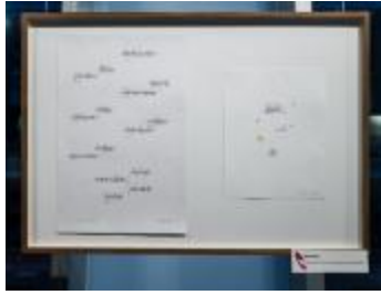
Score pages for "Tree Piece #17" by Wendy Reid, exhibited during OM 19 (2014) (IM.OM.FP.0019a.014)