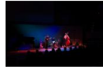
The Actual Trio performing during the last concert of OM 19 (2014) (IM.OM.FP.0019a.023)