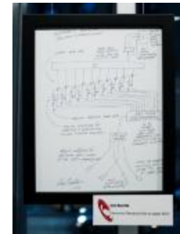
Don Buchla's score for "Harmonic Pendulum", exhibited during OM 19 (2014) (IM.OM.FP.0019a.015)