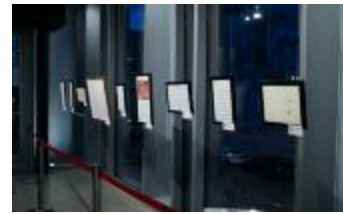
A view of the hanging score exhibition during OM 19 (2014) (IM.OM.FP.0019a.020)