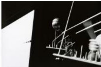
Mark Applebaum's "Mouseketier" instrument during a rehearsal before OM 19, San Francisco CA (2014) (IM.OM.FP.0019.019)