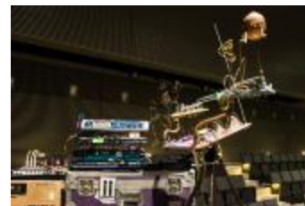
Side view of Mark Applebaum's "Mouseketier" instrument used in "Mouseketier Praxis", performed at OM 19, San Francisco CA (2014) (IM.OM.FP.0019a.002)