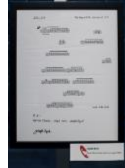
Joseph Byrd's score for "Water Music" exhibited during OM 19 (2014) (IM.OM.FP.0019a.011)