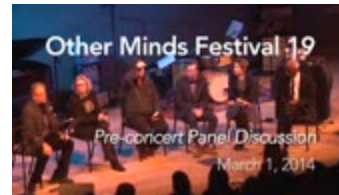
Other Minds Festival: OM 19: Panel Discussion and Concert 2 (Mar. 1, 2014), 1 of 6 (OMF.2014.03.01.c2.A)