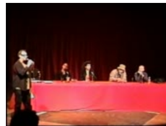
Other Minds Festival: OM 6: Artist Forum II, "Cultural Identity and Music in the Post- MODEM World" (March 18, 2000) (OMF.2000.03.18.02)