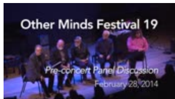
Other Minds Festival: OM 19: Panel Discussion and Concert 1 (Feb. 28, 2014), 1 of 9 (OMF.2014.02.28.c2.A)