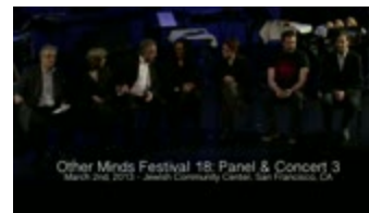
Other Minds Festival: OM 18: Panel Discussion & Concert 3 (video) (Mar. 2, 2013), 1 of 4 (OMF.2013.03.02.c2.A)