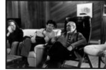
Jai Uttal, Philip Glass, and Conlon Nancarrow during the Djerassi Resident Artists Program in Woodside, CA (1993) (IM.OM.FP.0001.055)