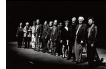
Full length view of the participating composers of the first Other Minds Festival standing on stage, San Francisco (1993) (IM.OM.FP.0001.043)