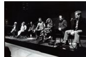
Participants of a panel on the legacy of John Cage during the 1st Other Minds Festival, San Francisco (1993) (IM.OM.FP.0001.047)