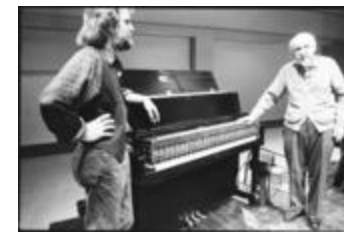
Trimpin, facing right, and Conlon Nancarrow, facing camera, standing, flanking a modified piano, (1993) (IM.OM.FP.0001.015)