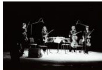
The Alyeska Quartet standing on stage after a performance at the first Other Minds Festival (1993) (IM.OM.FP.0001.037)