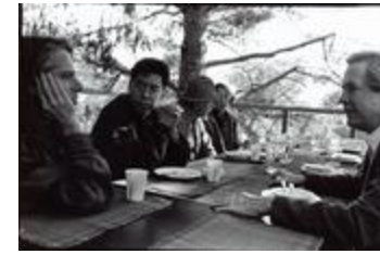
Several artists from the 1st Other Minds Festival seated at the outdoor dining table at the Djerassi Resident Artists Program, Woodside, CA (1993) (IM.OM.FP.0001.051)