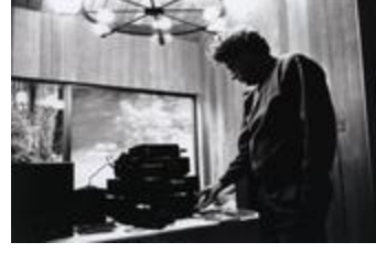
Philip Glass, three quarter length portrait, standing, adjusting stereo equipment, Woodside CA, (1993) (IM.OM.FP.0001.004)