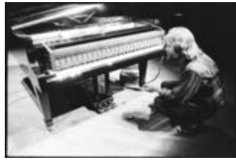
Trimpin, full length portrait, squatting, looking at modified piano, San Francisco CA, (1993) (IM.OM.FP.0001.029)