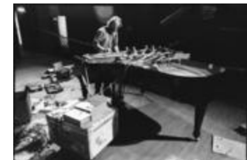
Trimpin, full length portrait, standing over and modifying piano, San Francisco CA, ver. 1, (1993) (IM.OM.FP.0001.023)