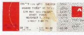
Ticket for OM 1, Concert 4, at Yerba Buena Gardens, November 7, 1993 (OMF.1993.11.07.TS)