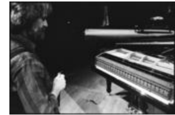
Trimpin, head and shoulder portrait, facing right, looking at modified piano, San Francisco CA, (1993) (IM.OM.FP.0001.027)