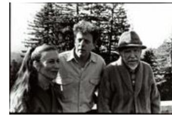
Meredith Monk facing right, Philip Glass facing left, & Conlon Nancarrow facing forward, half length portrait, Woodside CA, (1993) (IM.OM.FP.0001.035)