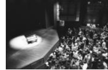
Modified piano and Conlon Nancarrow, in spotlights, in front of audience, ver. 2, San Francisco CA, (1993) (IM.OM.FP.0001.031)