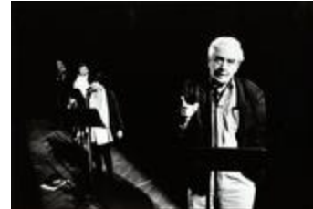
Three quarter length portrait of Robert Ashley onstage with performers during the 1st Other Minds Festival, San Francisco (1993) (IM.OM.FP.0001.044)