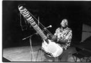
Foday Musa Suso performing during the 1st Other Minds Festival, San Francisco, CA (1993) (IM.OM.FP.0001.056)