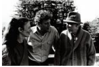
Meredith Monk, Philip Glass, & Conlon Nancarrow, half length portrait, facing each other, Woodside CA, (1993) (IM.OM.FP.0001.033)