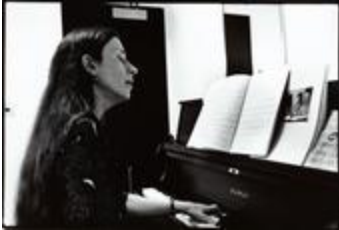
Meredith Monk facing forward, head and shoulders portrait, playing the piano, Woodside, CA (1993) (IM.OM.FP.0001.034)