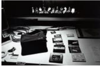
View from a sound booth during Other Minds Festival 1, San Francisco (1993) (IM.OM.FP.0001.046)