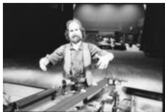
Trimpin, half length portrait, standing behind piano, facing forward, San Francisco CA, (1993) (IM.OM.FP.0001.013)