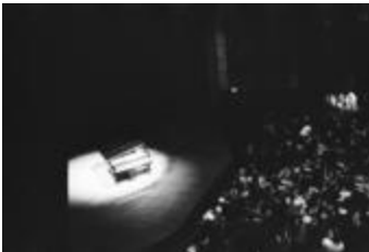
Modified piano and Conlon Nancarrow, in spotlights, in front of audience, ver. 1, San Francisco CA, (1993) (IM.OM.FP.0001.030)