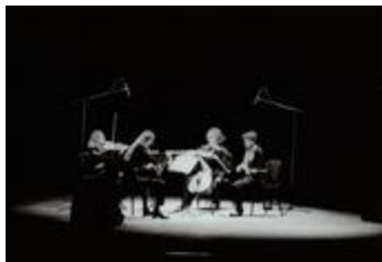
The Alyeska Quartet performing during the first Other Minds Festival (1993) (IM.OM.FP.0001.038)