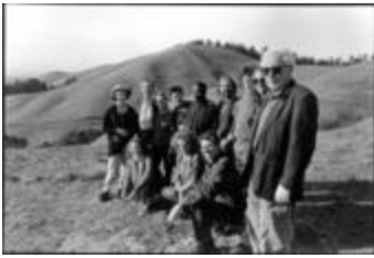
Other Minds Festival 1 participants and friends at the Djerassi Resident Artists Program in Woodside, CA (1993) (IM.OM.FP.0001.054)