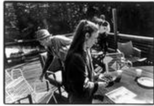
Meredith Monk, Conlon Nancarrow, and Foday Musa Suso outside on a deck in Woodside, CA (1993) (IM.OM.FP.0001.057)