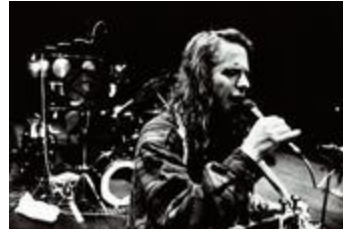
Half length portrait of Jai Uttal performing onstage during the 1st Other Minds Festival, San Francisco (1993) (IM.OM.FP.0001.045)