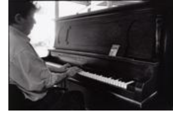
Philip Glass, playing the piano, seen from the side and slightly behind, Woodside CA, (1993) (IM.OM.FP.0001.003)