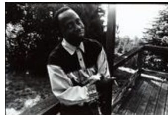
Half length portrait of Foday Musa Suso outside on a deck in Woodside, CA (1993) (IM.OM.FP.0001.048)