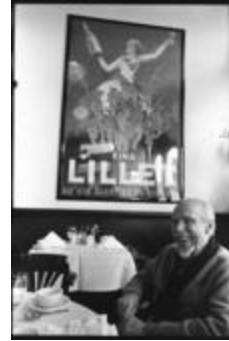
Conlon Nancarrow, half length portrait, seated, facing slightly left, in restaurant, (1993) (IM.OM.FP.0001.032)