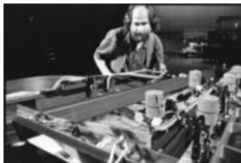
Trimpin, half length portrait, bending over modified piano, looking forward, San Francisco CA, (1993) (IM.OM.FP.0001.022)