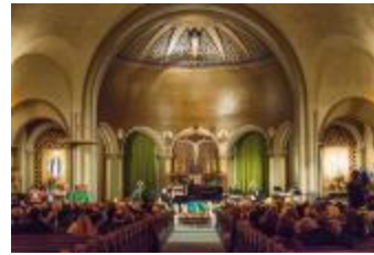
Dennis Russell Davies at the piano inside the Mission Dolores Basilica during the first concert of OM 22, San Francisco CA (February 18, 2017) (IM.OM.FP.0022.002)