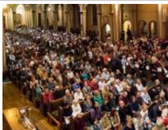
The attending audience for Lou Harrison Gamelan Masterpieces during OM 22 at the Mission Dolores Basilica in San Francisco, CA (May 20, 2017) (IM.OM.FP.0022.028)