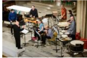
The William Winant Percussion Group performing Canticle No. 3 by Lou Harrison during OM 22, San Francisco CA (February 18, 2017) (IM.OM.FP.0022.007)