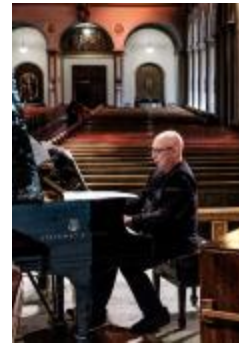
Dennis Russell Davies at the piano during rehearsals for OM 22, San Francisco CA (February 18, 2017) (IM.OM.FP.0022.014)