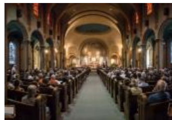
Interior view of the Mission Dolores Basilica from the aisle, during OM 22, San Francisco CA (May 20, 2017) (IM.OM.FP.0022.023)