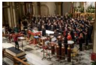
Performance of Lou Harrison's "La Koro Sutro" for large mixed chorus, organ, harp, and American Gamelan closing the final concert of OM 22, San Francisco, CA (May 20, 2017) (IM.OM.FP.0022.030)