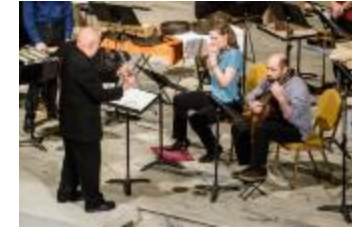
Dennis Russell Davies conducting the William Winant Percussion Group during OM 22, San Francisco CA (February 18, 2017) (IM.OM.FP.0022.005)