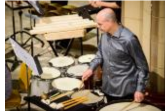
Percussionist Loren Mach during a performance of Canticle No. 3 by Lou Harrison during OM 22, San Francisco CA (February 18, 2017) (IM.OM.FP.0022.006)