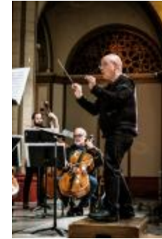
Dennis Russell Davies conducting the Other Minds Ensemble during a rehearsal prior to OM 22, San Francisco CA (February 18, 2017)