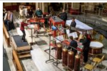
Performance of Lou Harrison's Suite for Violin and American Gamelan during OM 22, San Francisco CA (May 20, 2017) (IM.OM.FP.0022.027)