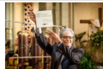
Charles Amirkhanian holding up the Champion of New Music Award given by the American Composers Forum during OM 22, San Francisco CA (May 20, 2017) (IM.OM.FP.0022.025)