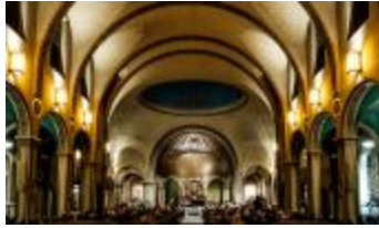
Interior view of the Mission Dolores Basilica during OM 22, San Francisco CA (February 18, 2017) (IM.OM.FP.0022.020)