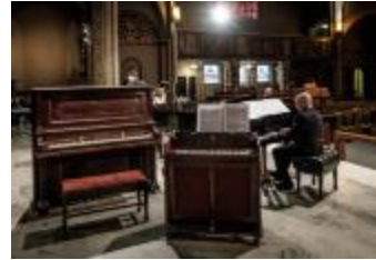
Stage view of the tack piano and celesta used in the performance of Lou Harrison's Suite for Violin, Piano, and Small Orchestra during OM 22, San Francisco CA (February 18, 2017) (IM.OM.FP.0022.018)