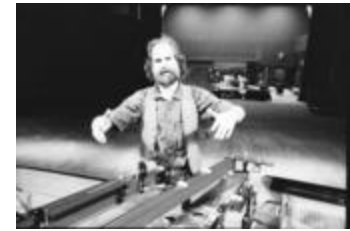
Trimpin, half length portrait, standing behind piano, facing forward, San Francisco CA, (1993) (IM.OM.FP.0001.013)