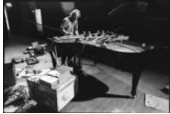
Trimpin, full length portrait, standing over and modifying piano, San Francisco CA, ver. 1, (1993) (IM.OM.FP.0001.023)