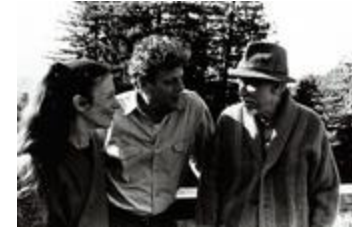
Meredith Monk, Philip Glass, & Conlon Nancarrow, half length portrait, facing each other, Woodside CA. (1993) (IM.OM.FP.0001.033)