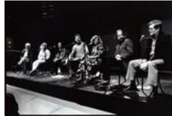
Participants of a panel on the legacy of John Cage during the 1st Other Minds Festival, San Francisco (1993) (IM.OM.FP.0001.047)