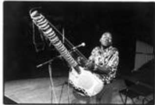
Foday Musa Suso performing during the 1st Other Minds Festival, San Francisco, CA (1993) (IM.OM.FP.0001.056)