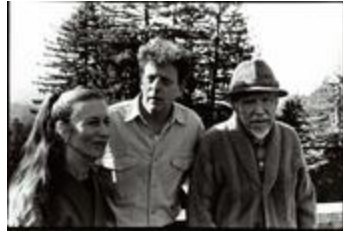
Meredith Monk facing right, Philip Glass facing left, & Conlon Nancarrow facing forward, half length portrait, Woodside CA, (1993) (IM.OM.FP.0001.035)