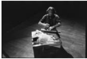
Trimpin, seated, working on a control device for a modified piano, San Francisco CA, (1993) (IM.OM.FP.0001.020)