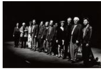
Full length view of the participating composers of the first Other Minds Festival standing on stage, San Francisco (1993) (IM.OM.FP.0001.043)