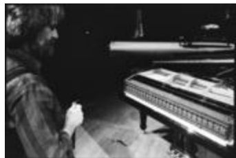
Trimpin, head and shoulder portrait, facing right, looking at modified piano, San Francisco CA, (1993) (IM.OM.FP.0001.027)