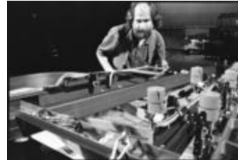
Trimpin, half length portrait, bending over modified piano, looking forward, San Francisco CA, (1993) (IM.OM.FP.0001.022)