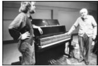
Trimpin, facing right, and Conlon Nancarrow, facing camera, standing, flanking a modified piano, (1993) (IM.OM.FP.0001.015)