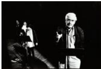
Three quarter length portrait of Robert Ashley onstage with performers during the 1st Other Minds Festival, San Francisco (1993) (IM.OM.FP.0001.044)