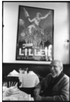
Conlon Nancarrow, half length portrait, seated, facing slightly left, in restaurant, (1993) (IM.OM.FP.0001.032)