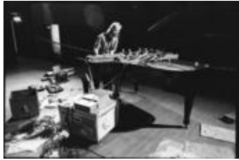
Trimpin, full length portrait, standing over and modifying piano, San Francisco CA, ver. 2, (1993) (IM.OM.FP.0001.024)