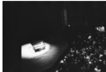
Modified piano and Conlon Nancarrow, in spotlights, in front of audience, ver. 1, San Francisco CA, (1993) (IM.OM.FP.0001.030)