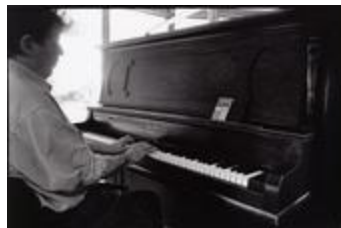
Philip Glass, playing the piano, seen from the side and slightly behind, Woodside CA, (1993) (IM.OM.FP.0001.003)