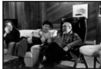
Jai Uttal, Philip Glass, and Conlon Nancarrow during the Djerassi Resident Artists Program in Woodside, CA (1993) (IM.OM.FP.0001.055)