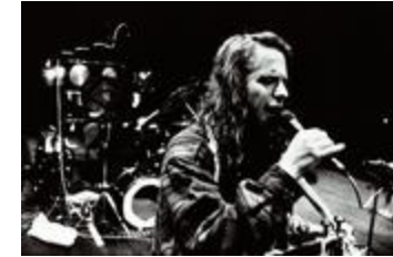
Half length portrait of Jai Uttal performing onstage during the 1st Other Minds Festival, San Francisco (1993) (IM.OM.FP.0001.045)