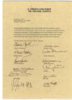
A Proclamation to Frank Zappa by OM 1 Composers, 1993 (OMF.1993.11.02.FZ)