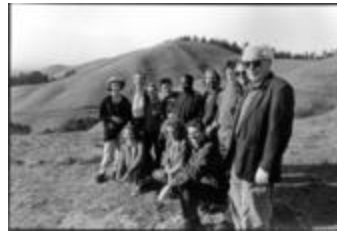
Other Minds Festival 1 participants and friends at the Djerassi Resident Artists Program in Woodside, CA (1993) (IM.OM.FP.0001.054)