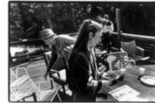
Meredith Monk, Conlon Nancarrow, and Foday Musa Suso outside on a deck in Woodside, CA (1993) (IM.OM.FP.0001.057)