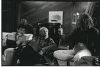
Julia Wolfe (r to l), talking to Conlon Nancarrow and Philip Glass in Woodside, CA (1993) (IM.OM.FP.0001.036)