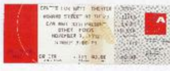
Ticket for OM 1, Concert 4, at Yerba Buena Gardens, November 7, 1993 (OMF.1993.11.07.TS)