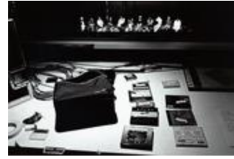
View from a sound booth during Other Minds Festival 1, San Francisco (1993) (IM.OM.FP.0001.046)