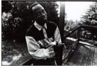
Half length portrait of Foday Musa Suso outside on a deck in Woodside, CA (1993) (IM.OM.FP.0001.048)