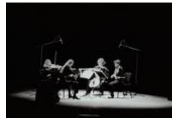
The Alyeska Quartet performing during the first Other Minds Festival (1993) (IM.OM.FP.0001.038)