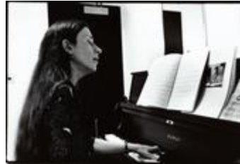
Meredith Monk facing forward, head and shoulders portrait, playing the piano, Woodside, CA (1993) (IM.OM.FP.0001.034)