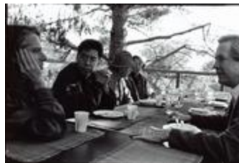
Several artists from the 1st Other Minds Festival seated at the outdoor dining table at the Djerassi Resident Artists Program, Woodside, CA (1993) (IM.OM.FP.0001.051)