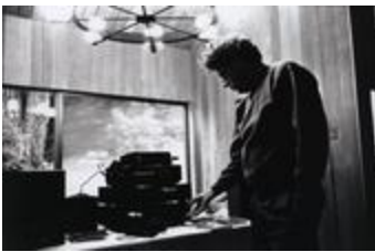
Philip Glass, three quarter length portrait, standing, adjusting stereo equipment, Woodside CA, (1993) (IM.OM.FP.0001.004)