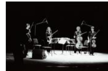
The Alyeska Quartet standing on stage after a performance at the first Other Minds Festival (1993) (IM.OM.FP.0001.037)