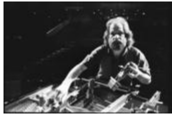
Trimpin, half length portrait, facing forward, modifying interior of piano, San Francisco CA, (1993) (IM.OM.FP.0001.019)