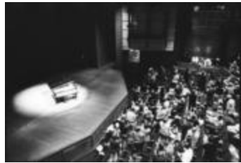
Modified piano and Conlon Nancarrow, in spotlights, in front of audience, ver. 2, San Francisco CA, (1993) (IM.OM.FP.0001.031)