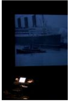
Michael Nyman, seated at piano, back to camera, with an image of ships projected above him, vertical ver. San Francisco CA., (2005)