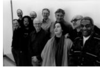
The composers and organizers of the 11th Other Minds Festival, half length portrait, Woodside, CA (2005) (IM.OM.FP.0011.024)