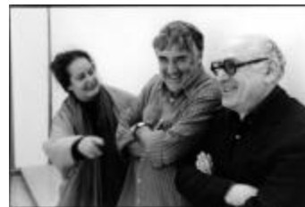
Maria de Alvear, looking right at Fred Frith and Michael Nyman, half length portrait, Woodside, CA (2005) (IM.OM.FP.0011.016)