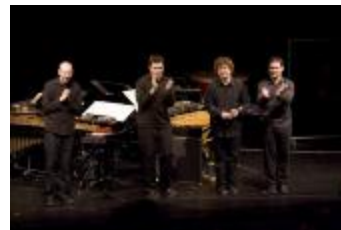
So Percussion on stage after a performance during OM 11, San Francisco CA (2005) (IM.OM.FP.0011b.064)