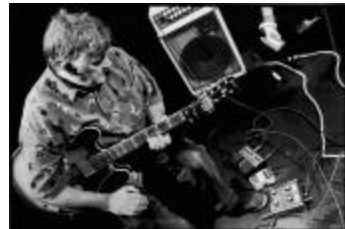
Fred Frith holding guitar, performing or rehearsing during the 11th Other Minds Festival, San Francisco, CA (2005) (IM.OM.FP.0011.029)