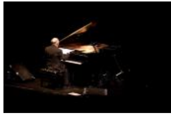
Michael Nyman, full length portrait, seated at piano, back to camera, facing slightly right, ver. 3, San Francisco, CA., (2005) (IM.OM.FP.0011b.003)