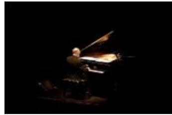
Michael Nyman, full length portrait, seated at piano, back to camera, facing slightly right, ver. 2, San Francisco, CA., (2005) (IM.OM.FP.0011b.002)