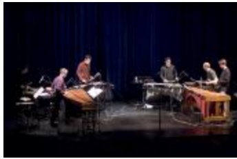
So Percussion performing on stage during the third concert of OM 11, San Francisco CA (2005) (IM.OM.FP.0011b.070)