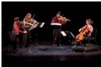
Del Sol Quartet performing on stage during OM 11, ver. 10, San Francisco CA (2005) (IM.OM.FP.0011b.019)