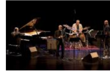
Billy Bang and his quintet on stage before a performance during OM 11, San Francisco CA (2005) (IM.OM.FP.0011b.071)