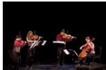
Del Sol Quartet performing on stage during OM 11, ver. 06, San Francisco CA (2005) (IM.OM.FP.0011b.015)