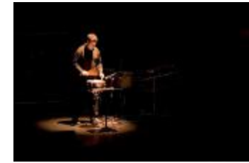
Member of So Percussion performing on stage, during OM 11 ver. 02, San Francisco CA (2005) (IM.OM.FP.0011b.055)