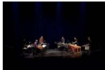
So Percussion performing on stage during OM 11, San Francisco CA (2005) (IM.OM.FP.0011b.065)