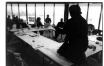
Maria de Alvear, kneeling on table with back to camera, during a private presentation with fellow OM 11 composers, Woodside, CA (2005) [Duplicate] (IM.OM.FP.0011.015)