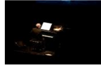
Michael Nyman, full length portrait, seated at piano, back to camera, facing slightly right, ver. 4, San Francisco, CA., (2005) (IM.OM.FP.0011b.004)