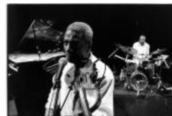
Head and shoulders portrait of Billy Bang with violin, in front of a microphone during a performance for the 11th Other Minds Festival, San Francisco (2005) (IM.OM.FP.0011.004)