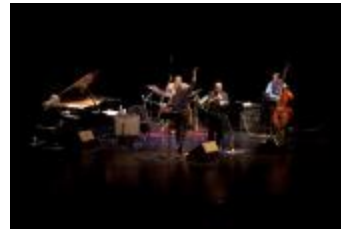
The Billy Bang Quintet performing during OM 11 ver. 04, San Francisco CA (2005) (IM.OM.FP.0011b.084)