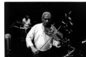
Half length portrait of Billy Bang playing the violin onstage with members of his quintet during the 11th Other Minds Festival, San Francisco (2005) (IM.OM.FP.0011.003)