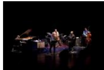
The Billy Bang Quintet performing during OM 11 ver. 03, San Francisco CA (2005) (IM.OM.FP.0011b.080)