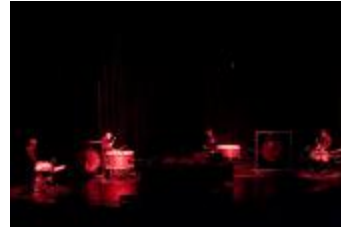
So Percussion performing on stage, during OM 11 ver. 03, San Francisco CA (2005) (IM.OM.FP.0011b.060)