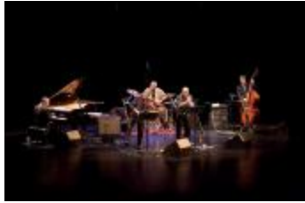
The Billy Bang Quintet performing during OM 11, San Francisco CA (2005) (IM.OM.FP.0011b.074)