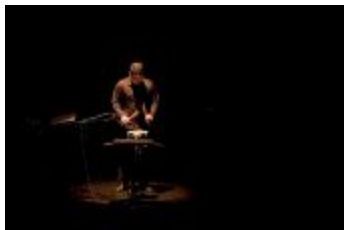
Member of So Percussion performing on stage, during OM 11 ver. 01, San Francisco CA (2005) (IM.OM.FP.0011b.054)