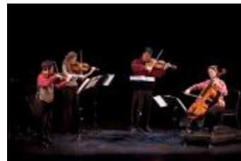
Del Sol Quartet performing on stage during OM 11, ver. 03, San Francisco CA (2005) (IM.OM.FP.0011b.012)