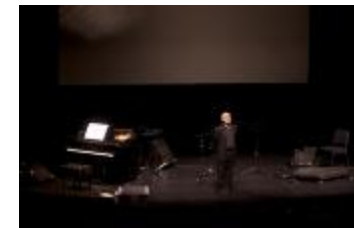
Michael Nyman, standing on stage next to piano, facing slightly right, San Francisco CA., (2005) (IM.OM.FP.0011b.008)