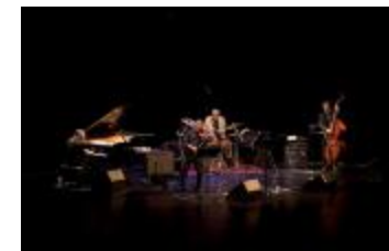
The Billy Bang Quintet performing during OM 11 ver. 02, San Francisco CA (2005) (IM.OM.FP.0011b.075)