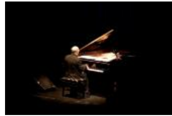
Michael Nyman, full length portrait, seated at piano, back to camera, facing slightly right, ver. 1, San Francisco, CA., (2005) (IM.OM.FP.0011b.001)