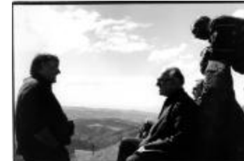
Fred Frith, Michael Nyman, Evan Ziporyn and Billy Bang, talking outdoors, Woodside, CA (2005)