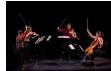
Del Sol Quartet performing on stage during OM 11, ver. 13, San Francisco CA (2005) (IM.OM.FP.0011b.022)