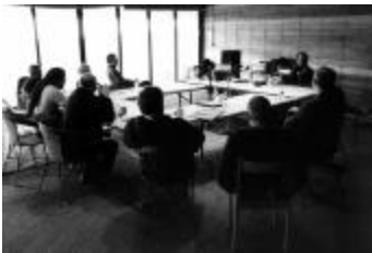
OM 11 participants seated around a table during private discussions at the Djerassi Resident Artists Program, Woodside, CA (2005) (IM.OM.FP.0011.022)