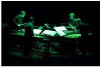
So Percussion performing on stage, during OM 11, San Francisco CA (2005) (IM.OM.FP.0011b.058)