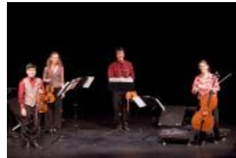
Del Sol Quartet performing on stage during OM 11, ver. 15, San Francisco CA (2005) (IM.OM.FP.0011b.024)