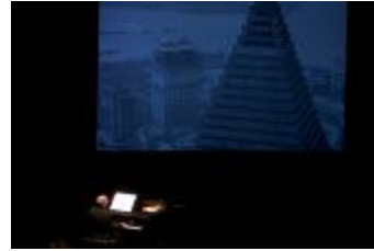
Michael Nyman, seated at piano, back to camera, with an image of city buildings projected above him, San Francisco CA., (2005) (IM.OM.FP.0011b.005)