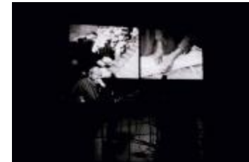
Phil Niblock seated onstage with film projections behind him, San Francisco, CA (2005) (IM.OM.FP.0011.031)