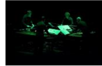
So Percussion performing on stage, during OM 11 ver. 02, San Francisco CA (2005) (IM.OM.FP.0011b.059)