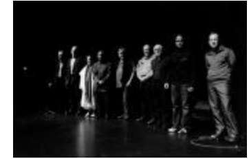
The composers of the 11th Other Minds Festival, standing on stage, San Francisco, CA (2005) (IM.OM.FP.0011.023)