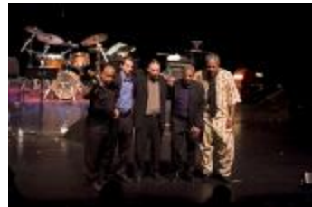
The Billy Bang Quintet standing onstage together after their performance at OM 11, San Francisco CA (2005) (IM.OM.FP.0011b.085)