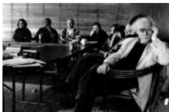
Featured OM 10 composers, half length portrait, seated at table, listening, Woodside CA., (2004) (IM.OM.FP.0010.020)