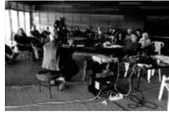
Joan Jeanrenaud, seated, back to camera, demonstrates cello to OM 10 participants, who are seated at conference table, facing forward, Woodside Ca., (2004) (IM.OM.FP.0010.014)