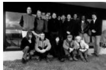
Featured OM 10 participants, full length portrait, standing and seated, facing forward, Woodside CA., (2004) (IM.OM.FP.0010.018)