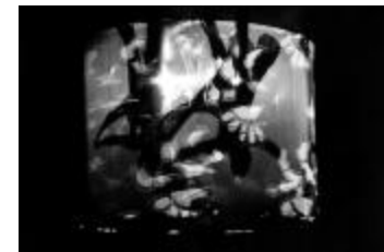
Sample of the lighting and set design for the performance of "Ashtayama: Song of Hours," San Francisco CA, (2004) (IM.OM.FP.0010.005)