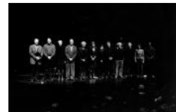
Featured OM 10 participants, full length portrait, standing, facing forward, San Francisco CA., (2004) (IM.OM.FP.0010.017)