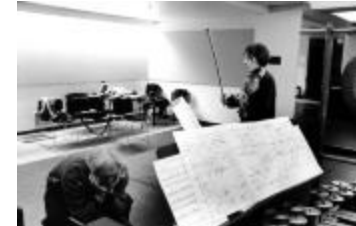
Tigran Mansurian, seated, head in hands, facing down and slightly right, and Kim Kashkashian with viola, half length portrait, facing left, (2004) (IM.OM.FP.0010.025)