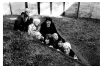
OM 10 participants, heads and shoulders & half length portrait, seated in ground sculpture, facing forward, Woodside CA., (2004) (IM.OM.FP.0010.019)