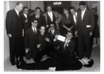
Invited Composers to the Exposition Universelle et Internationale, Brussels Belgium, vs. 2, 1958 (IM.CA.PC.0035.001)

1965 ONCE Festival: Concert Four (C.1965.02.14)