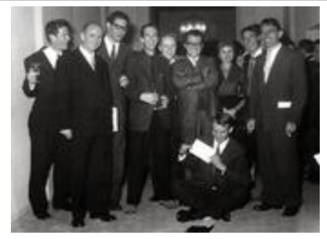
Invited Composers to the Exposition Universelle et Internationale, Brussels Belgium, 1958 (IM.CA.PC.0035.010)