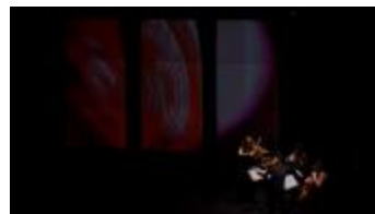
The Del Sol String Quartet performing Ken Ueno's "Peradam" with live video projections, vs. 3, OM 17 (IM.OM.FP.0017b.004)