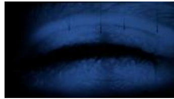
Projection image of an eye lid during performance of "Half a Bit of Nothing Integrated, for amplified objects, and live video" by Simon Steen-Anderson, OM 17 (IM.OM.FP.0017a.003)