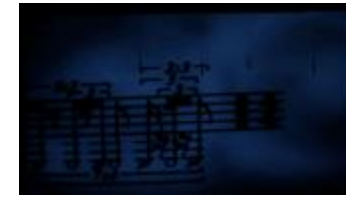
Projection image of musical notation during performance of "Half a Bit of Nothing Integrated, for amplified objects, and live video" by Simon Steen-Anderson, OM 17 (IM.OM.FP.0017a.001)