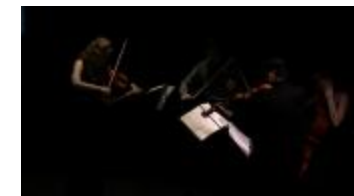
The Del Sol String Quartet performing Ken Ueno's "Peradam", OM 17 (IM.OM.FP.0017b.002)