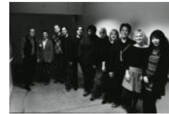
Directors and artists of the 17th Other Minds Festival lined up backstage, San Francisco CA (2012) (IM.OM.FP.0017.015)