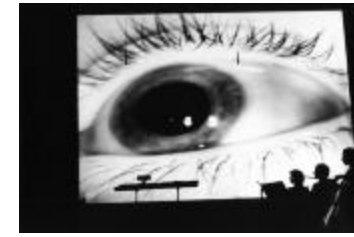
asamisimasa performing Simon Steen-Anderson's "Half a Bit of Nothing Integrated, for amplified objects, and live video" during OM 17, San Francisco CA (2012) (IM.OM.FP.0017.003)