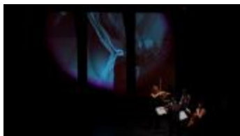
The Del Sol String Quartet performing Ken Ueno's "Peradam" with live video projections, vs. 4, OM 17 (IM.OM.FP.0017b.005)