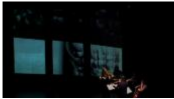
The Del Sol String Quartet performing Ken Ueno's "Peradam" with live video projections, OM 17 (IM.OM.FP.0017b.001)