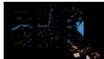
The Del Sol String Quartet performing Ken Ueno's "Peradam" with live video projections, vs. 2, OM 17 (IM.OM.FP.0017b.003)