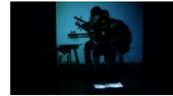
Tanja Orning performing Simon Steen-Andersen's "Study for String Instrument No. 3, for cello and video", vs. 5, at OM 17 (IM.OM.FP.0017c.005)