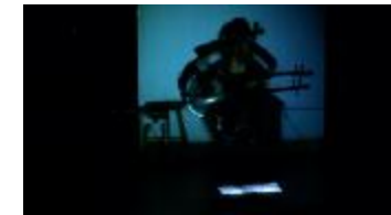
Tanja Orning performing Simon Steen-Andersen's "Study for String Instrument No. 3, for cello and video" at OM 17 (IM.OM.FP.0017c.001)