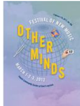
Other Minds Festival 17: Concert Program Guide (OMF.2012.02.29-03.03.PP)