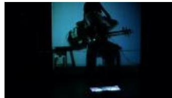
Tanja Orning performing Simon Steen-Andersen's "Study for String Instrument No. 3, for cello and video", vs. 3, at OM 17 (IM.OM.FP.0017c.003)