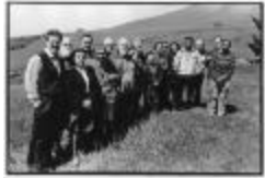
Featured composers of OM 2, full length portrait, standing, Woodside CA, (1995) (IM.OM.FP.0002.030)