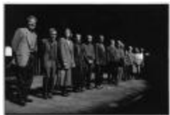
The featured composers of OM 2, full length portrait, standing, facing forward, (1995) (IM.OM.FP.0002.021)