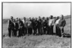
Featured composers of OM 2, full length portrait, standing, facing forward, Woodside CA, (1995) (IM.OM.FP.0002.019)