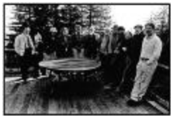
Some of the featured composers of OM 2, full length portrait, standing, facing forward, Woodside CA, (1995) (IM.OM.FP.0002.020)