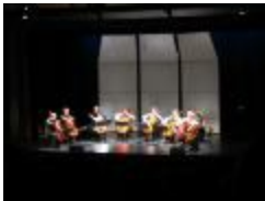
The Amsterdam Cello Octet, performing on stage, San Francisco CA., (2009) (IM.OM.FP.0014b.009)