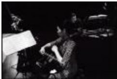
The piano trio ensemble, Trio con Brio Copenhagen, rehearsing on stage during OM 14, San Francisco CA, (2009) (IM.OM.FP.0014.003)