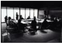
Linda Catlin Smith, seated before a microphone, giving a presentation to a room full of OM 14 composers and organizers, Woodside CA., (2009) (IM.OM.FP.0014.028)