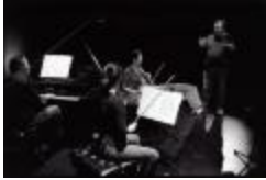
Members of the chamber ensemble, Trio con Brio Copenhagen, listen to composer Bent Sørensen, during a rehearsal for OM 14, San Francisco CA, (2009) (IM.OM.FP.0014.005)