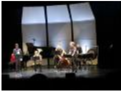
A musical sextet, full length portrait, performing on stage, San Francisco CA., (2009) (IM.OM.FP.0014b.014)