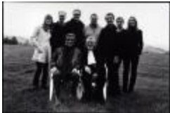
Featured OM 14 composers at Woodside CA, (2009) (IM.OM.FP.0014.012)