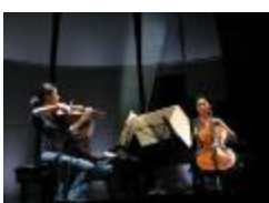
The piano trio ensemble, Trio con Brio Copenhagen, rehearsing for OM 14, ver. 1, San Francisco CA, (2009) (IM.OM.FP.0014b.004)