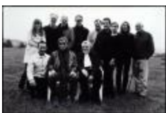
Featured OM 14 composers and organizers at Woodside CA, (2009) (IM.OM.FP.0014.025)