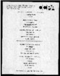
CCPA House Concert Series, Upcoming Events (December 10-11, 1983) (CCPA.POS.046)