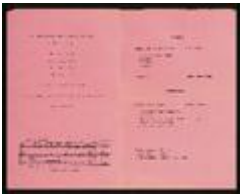
CCPA: Recital of Music for Flute and Piano (CCPA.POS.021)