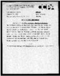
Windham Hill's "Elements" in Concert (PSA) (CCPA.POS.048)