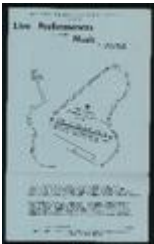
BeethovenBrahms "Bacch" Anale Presents: Live Performances of Chamber Music, Cambium Trio (CCPA.POS.020)